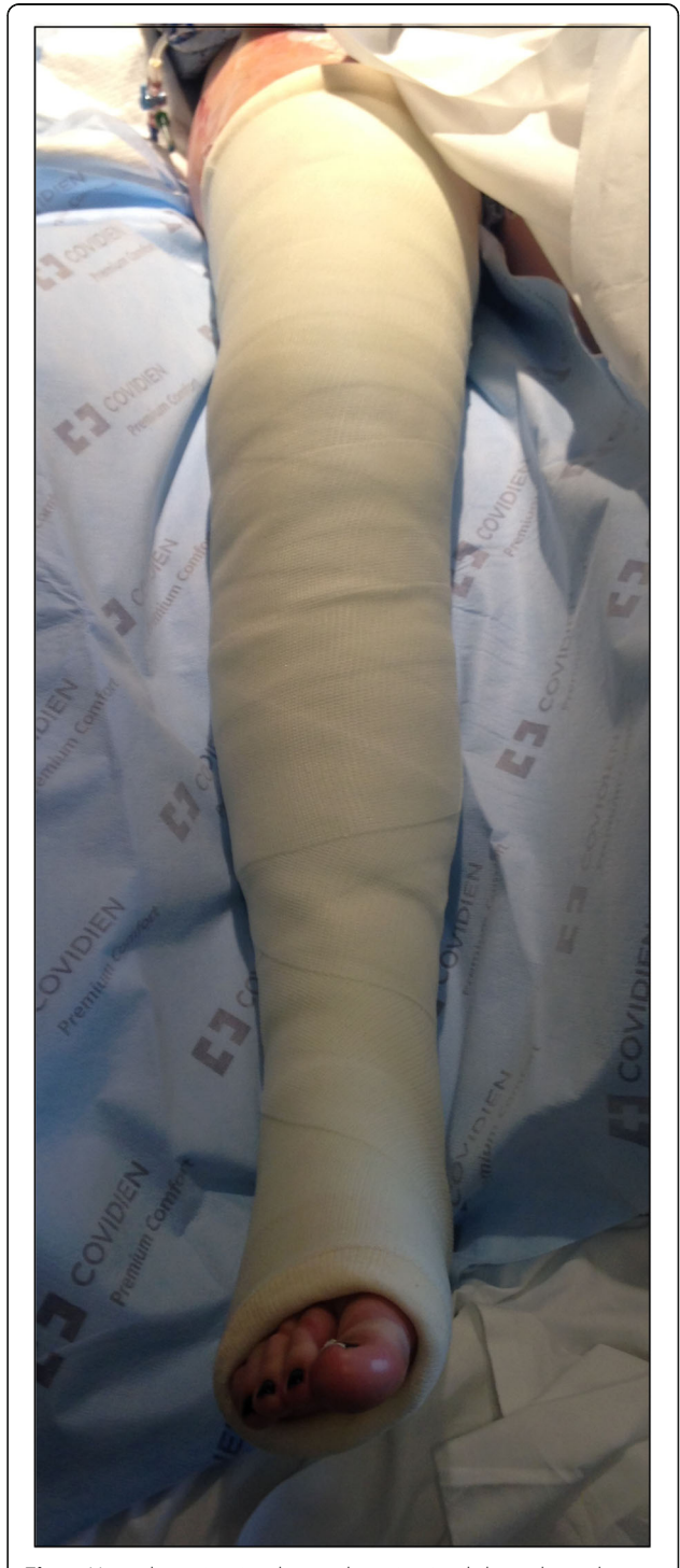
Fig. 5 Neutral rotation is adequately maintained throughout the casting session without the need for active patient participation

While the Boston technique can be implemented in any form of long leg casting, it is mostly utilized in our institution as a way to temporize patients whom have