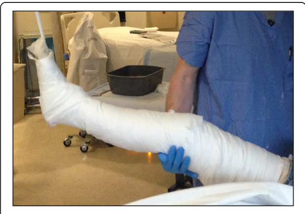
Fig. 2 A single palm may be carefully placed in the popliteal fossa with a posterior-to-anterior directed force to adjust the desired angulation of the knee