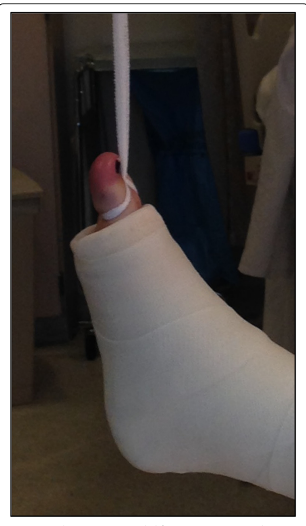
Fig. 1 Injured extremity suspended from an intravenous pole