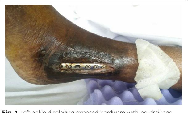
Fig. 1 Left ankle displaying exposed hardware with no drainage or erythema

During her initial work up the diagnosis of multilobular pneumonia was made and she was started on linezolid and aztreonam while initial blood cultures were negative. The