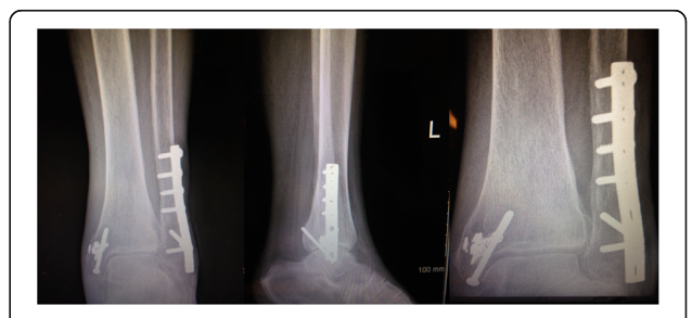
Fig. 2 Preoperative AP, lateral, and mortise view of left ankle demonstrating retained hardware