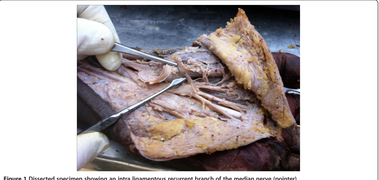
Figure 1 Dissected specimen showing an intra ligamentous recurrent branch of the median nerve (pointer).

Mean distance from the distal border of transverse carpal ligament to the superficial palmar arch was 11.48 mm.