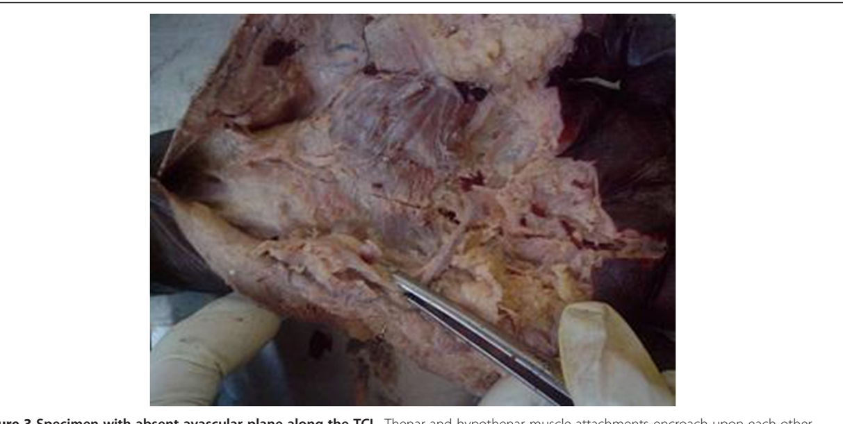
Figure 3 Specimen with absent avascular plane along the TCL. Thenar and hypothenar muscle attachments encroach upon each other across the midline.

Corresponding parameters in our study were noted to be 11.5 mm, 7.8 mm and 27.0 mm respectively (Table 1).