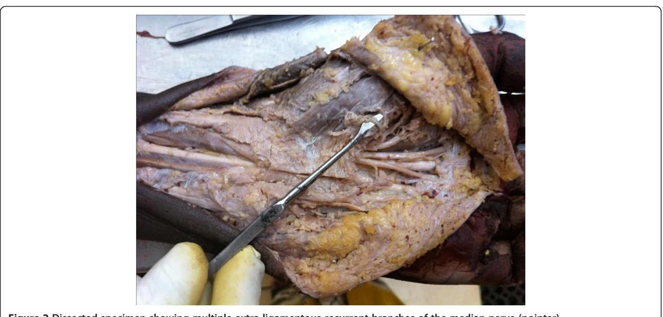
Figure 2 Dissected specimen showing multiple extra ligamentous recurrent branches of the median nerve (pointer).