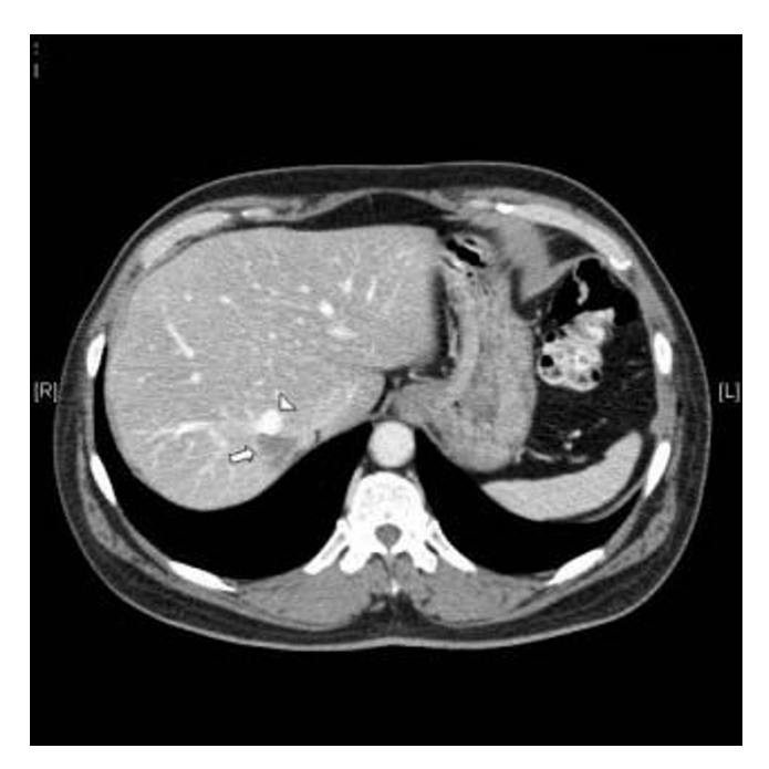
Figure I Transversal CT image of the patient's liver showing the right (arrowhead) in proximity to the tumor (arrow).

A 58-year-old male was admitted to our hospital in April 2007 with a suspected metastasis of a sigmoid cancer in the Couinaud segment (CS) 7 found during a follow-up examination using ultrasound. The patient had undergone a resection of the colon sigmoideum due to carcinoma in 2003. In addition to the liver metastasis, the patient suffered from mild hypertension and non-insulindependent diabetes mellitus. The only preoperative imaging was an abdominal ultrasound; thus, an additional CT scan of the abdomen was performed in preparation for the surgical intervention. The metastasis in the CS 7 had a size of 2.2 \times 2.4 cm and was closely attached to the right hepatic vein (Figure 1). After careful analysis of the CT scan, it became clear that the proximal part of the middle hepatic vein was completely missing, whereas its distal branches seemed to be open. In order to get more detailed information about the anatomical situation, an additional 3D imaging of this case was performed. It was evident that the middle hepatic vein was missing. Most likely this anatomical pattern was not tumour related because there was a close proximity of metastasis and right hepatic